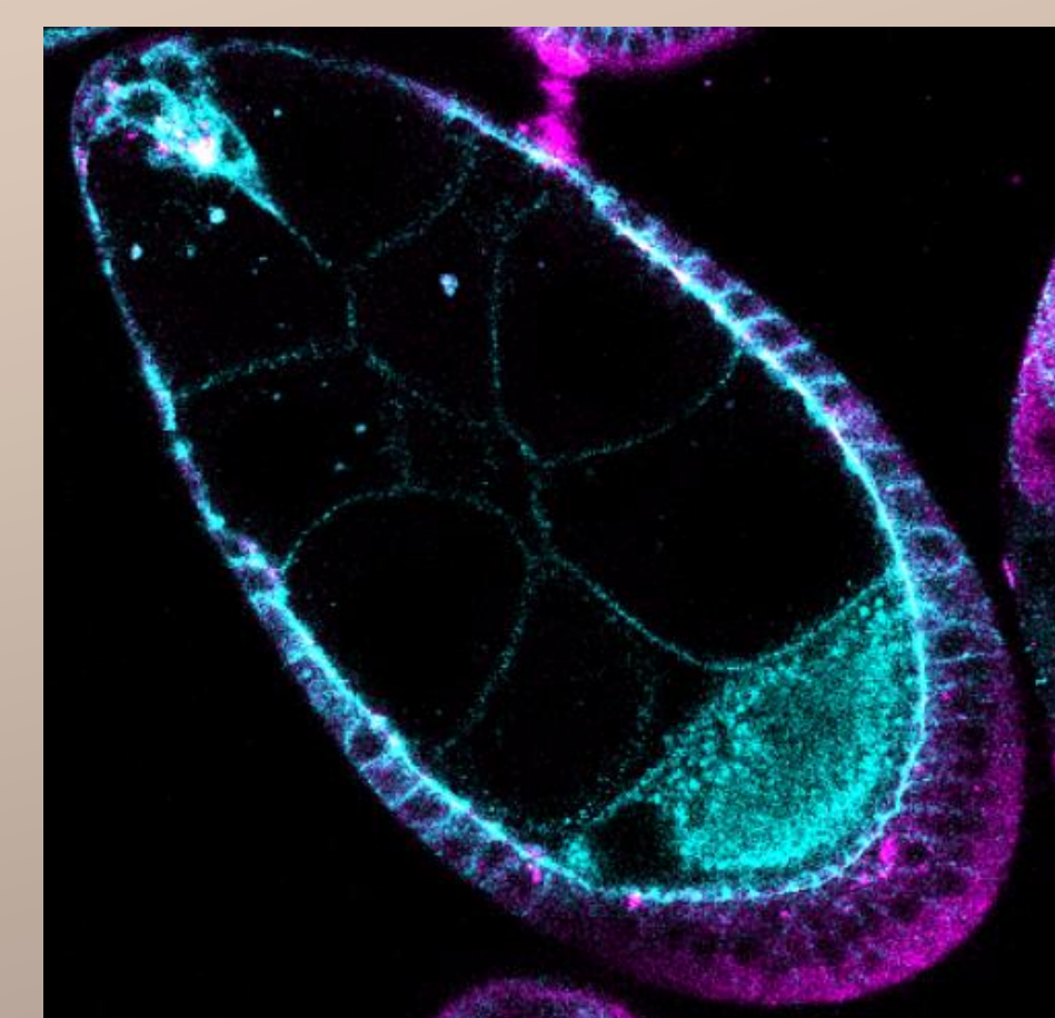
Drosophila ovarian follicle. Blue: E-cadherin; Purple: Myosin