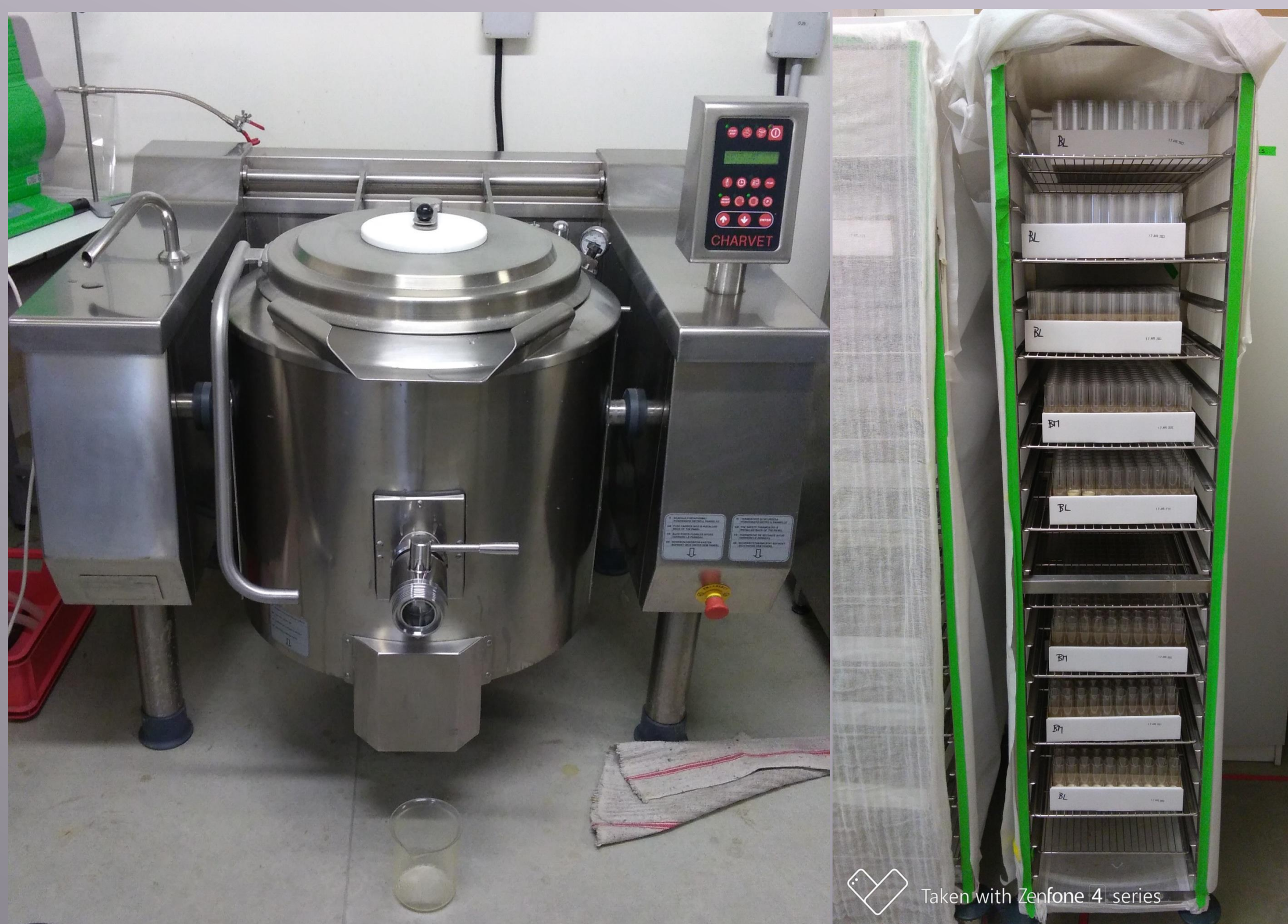
Production of breeding medium for Drosophila