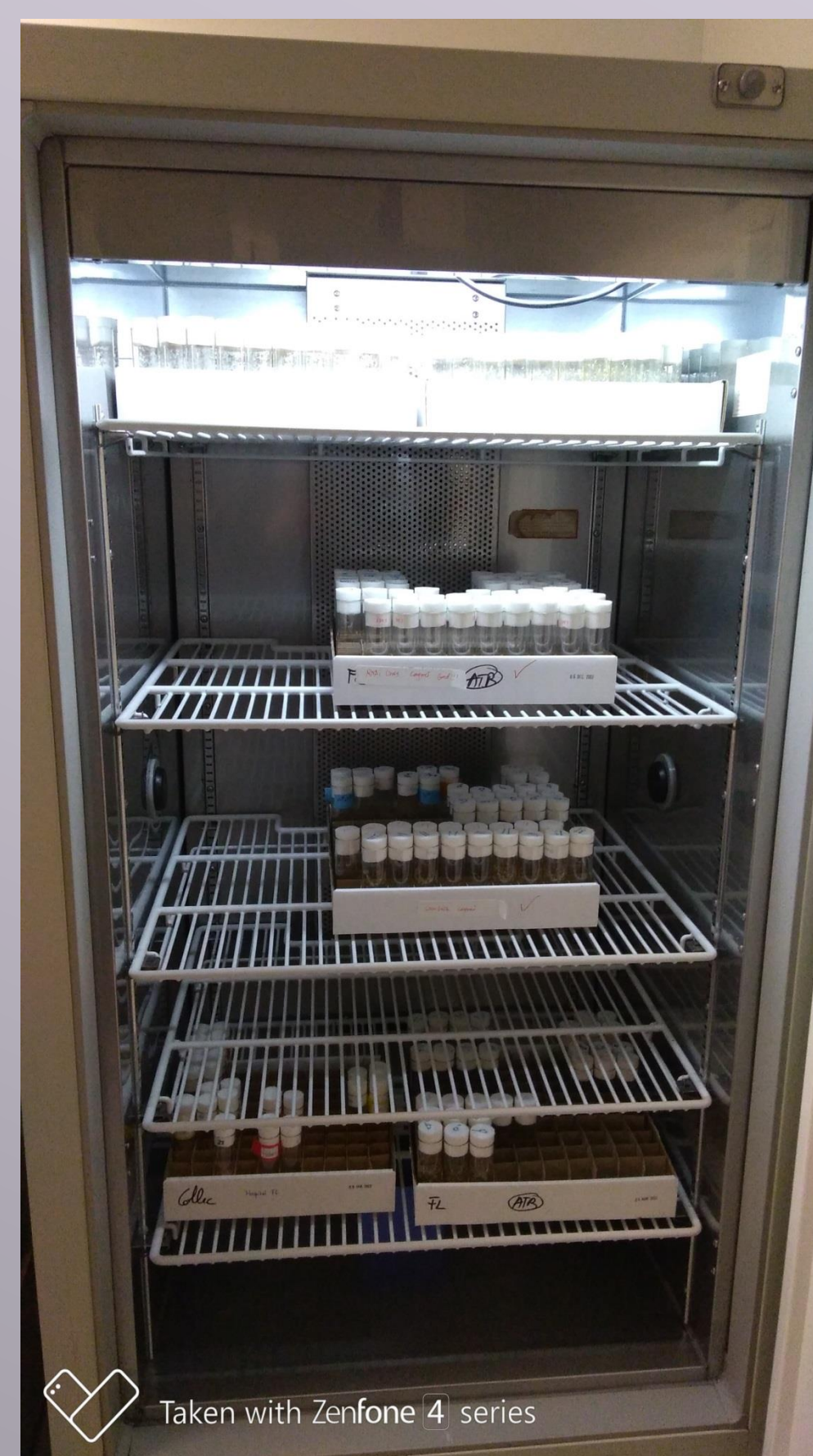
Breeding of Drosophila in an incubator at 25°C