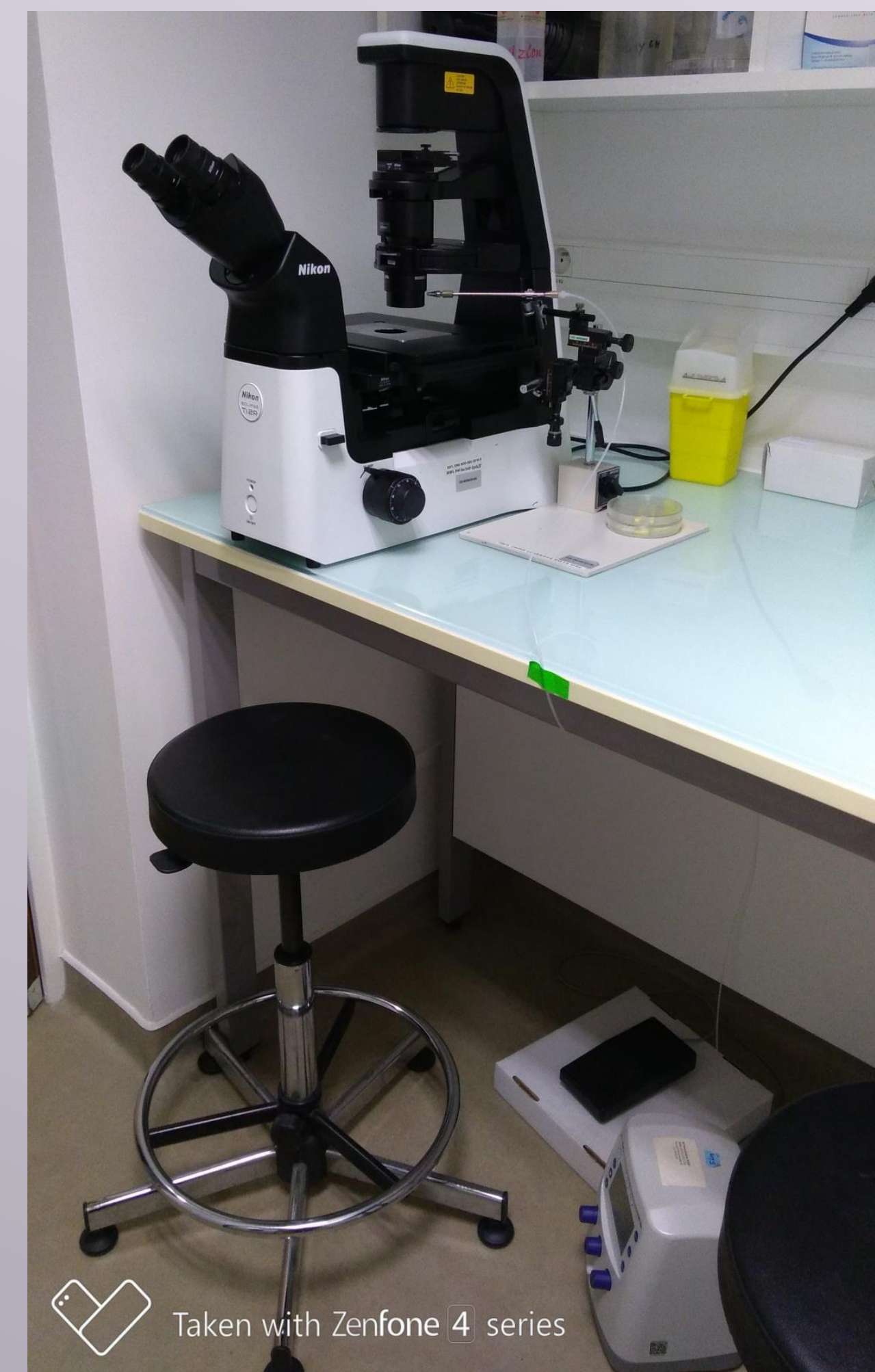
Injection in embryos for genome engineering